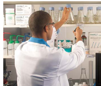
FIGURE 2: The inventory in each of the eight departments was assessed and optimized based on the specific needs at each point of use. Excess inventory (overstock) was then redistributed to other departments appropriately.

Do you need help streamlining scientific workflows?